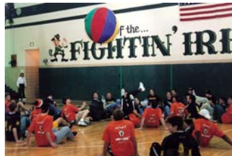
Irish Week - Photo Recovered From A Dumpster Behind ND - Aug of '07