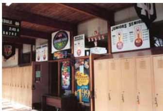
Irish Week - Photo Recovered From A Dumpster Behind ND - Aug of '07