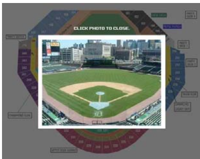
The view from our seats - section 326