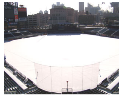
The view from our seats in February

Send check or money order payable to Friends of Notre Dame. Tickets will be mailed to you no later than August 11, 2008. Confirmation email will be sent once payment is received. Transportation, parking, and food are not included in price of ticket.