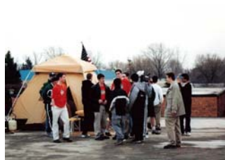
Irish Week - Photo Recovered From A Dumpster Behind ND - Aug of '07