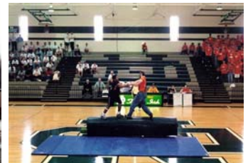
Irish Week - Photo Recovered From A Dumpster Behind ND - Aug of '07

Check the web site Often! We've got 100's of photos that will be uploaded!